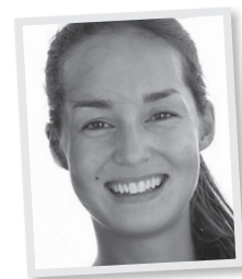
Photo: Please attach a smiling and friendly photo (no child wants a sad looking au pair). If you have a body piercing, you should consider removing it for the photo and keep it out during your stay in the USA as most host families will not want a pierced au pair. This photo is your host family's first impression. Make it a positive one.